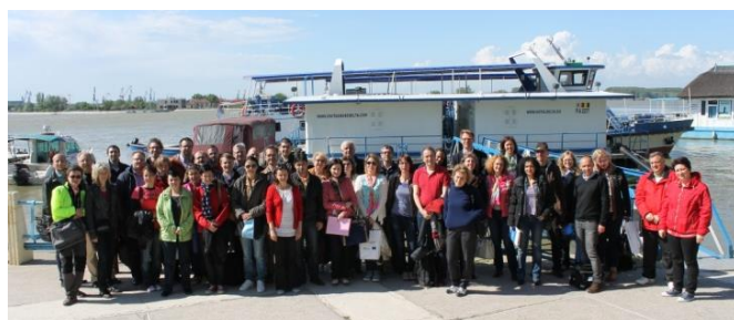
Partnermeeting in Tulcea, May 2014

Over the two years with TRANSDANUBE, the different studies have clearly shown how big the differences are between the regions of the upper and the lower Danube: Differences in terms of transport infrastructure and in the quality of the transport and mobility facilities provided, and in the awareness of the sustainable mobility concept in tourism. To exploit the economic and tourist development potential of the regions in a sustainable manner, it is necessary to put additional efforts into the improvement of sustainable mobility solutions to achieve better accessibility in the whole Danube region.