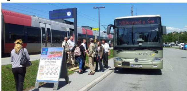
Direct changing from a train to a bus in Neusiedl am See, Austria

How to implement sustainable mobility in tourism? The Danube Competence Center (IPA PP1) collected good practice examples, which have been implemented in the Danube region - and beyond - over the last years. An analysis of these good practice examples clearly shows the complexity of such projects which require complex solutions and good coordination at intersectoral level, especially of the transport and tourism players, the need to integrate sustainability on strategic levels such as tourism or regional development plans, awareness raising for both the public and the guests and the importance of funding schemes for initiating and implementing sustainable mobility in the regions.