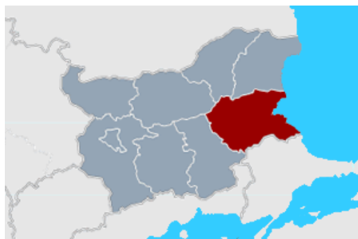
South-east region of Bulgaria

In Bulgaria, the study covers protected by Bulgarian legislation and the Natura 2000 sites within the South East region and under the administration of RIEWs Burgas and Stara Zagora. It covers nearly 100 areas, of which discussed in detail and mapped are 18, including the target area of the project - Burgas Lake Vaya.