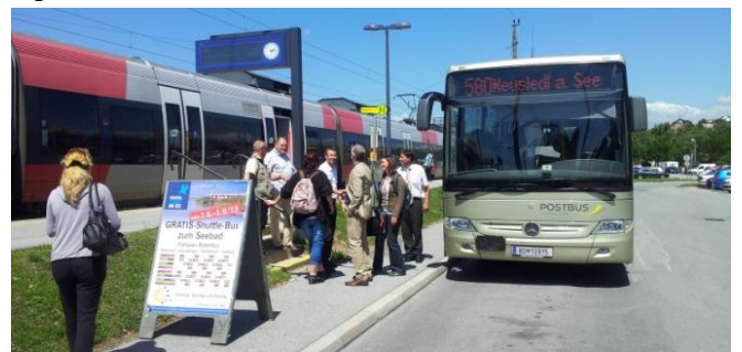
Direct changing from a train to a bus in Neusiedl am See, Austria

How to implement sustainable mobility in tourism? The Danube Competence Center (IPA PP1) collected good practice examples, which have been implemented in the Danube region - and beyond - over the last years. An analysis of these good practice examples clearly shows the complexity of such projects which require complex solutions and good coordination at intersectoral level, especially of the transport and tourism players, the need to integrate sustainability on strategic levels such as tourism or regional development plans, awareness raising for both the public and the guests and the importance of funding schemes for initiating and implementing sustainable mobility in the regions.